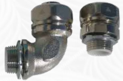
Smooth Bore on a SEALTITE® Type A 90-degree Fitting

The National Electrical Code (NEC) 2023 describes liquid tight non-metallic conduit (LFNC) as raceway of circular cross section: